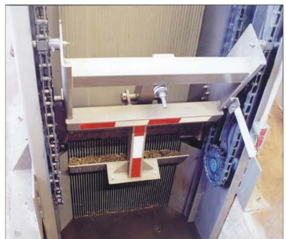
DRIVE MECHANISM LOCATED ABOVE WATER LEVEL