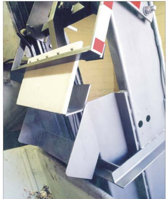
CLEAN SCREENINGS DISCHARGE

Trouble-free operation is ensured by use of non-corrosive materials of construction - stainless steel and engineering plastics.