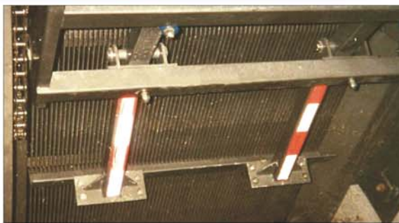
FULL DEPTH BAR RACK CLEANING