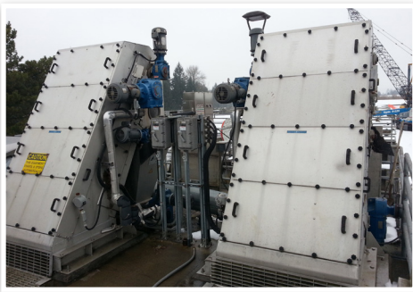
Completely enclosed for odor control and hygienic operation.