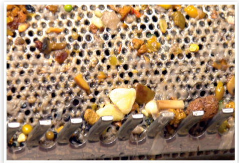
High capture rate including fats and debris.